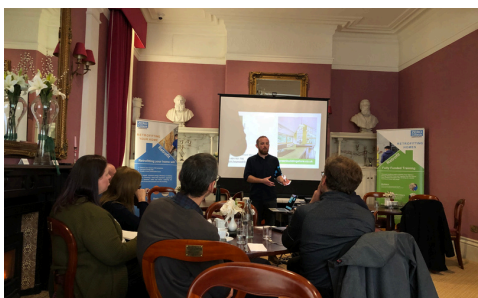
ZCH Retrofit Networking Event