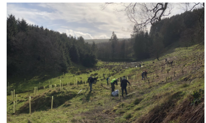
Supporting Rotary of Harrogate and volunteers for Nidderdale Tree Planting scheme