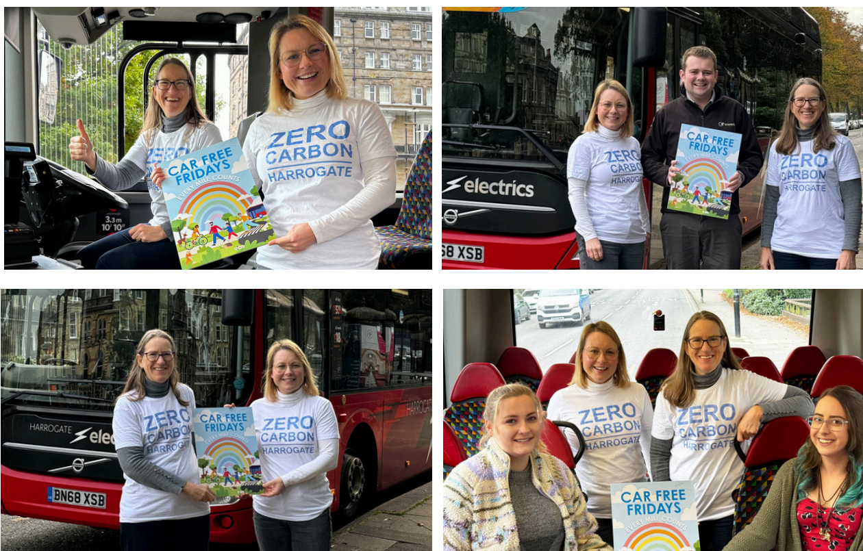
Car Free Fridays, Oct 2023

We have also grown our Car Free Friday's campaign, with almost all the Harrogate secondary schools and Harrogate College now taking part. The Harrogate Bus Company also continue to support the campaign by providing two for one tickets on Fridays, to encourage local commuters and the public to join in this positive climate action.