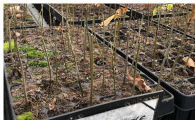
Acorns collected for germination at Leeds Arium