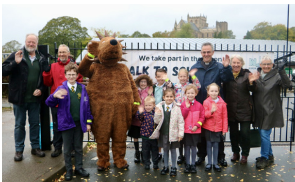
Ripon Cathedral event, Oct 2023

The primary school campaign, Walk to School Day, has enjoyed another successful year, with lots of positive press coverage. We have received fantastic support from local volunteers and community organisations including Ripon Together, as well as local councillors and Mayors. The pupils have also enjoyed walking in to school on event days with Harrogate Town AFC's Harry Gator mascot and North Yorkshire Council's Spike the Road Safety Hedgehog.