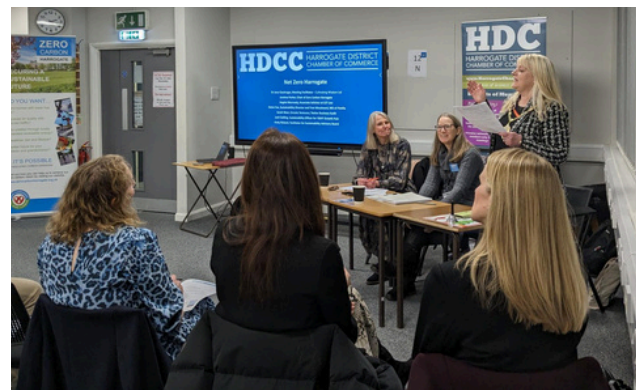
Harrogate Chamber of Commerce event, Nov 2023