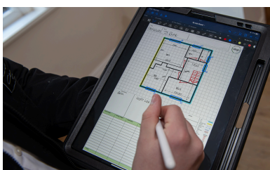
LEAD project in Selby