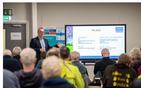
Householders retrofit event, Mar 2023