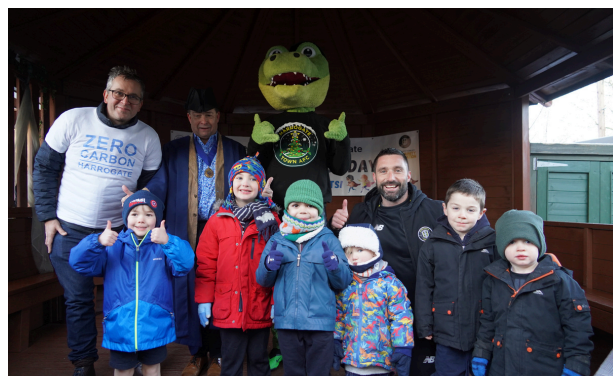
Oatlands School, Dec 2023